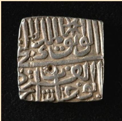
Silver Rupee 15th Century, Chiyas Shah of Malwa