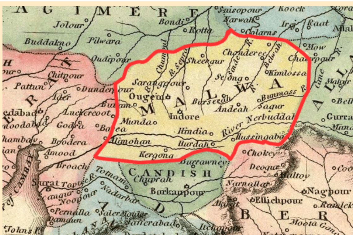
A map of Malwa 1823. Ajmer is to the Northwest, Gujrat to the West.