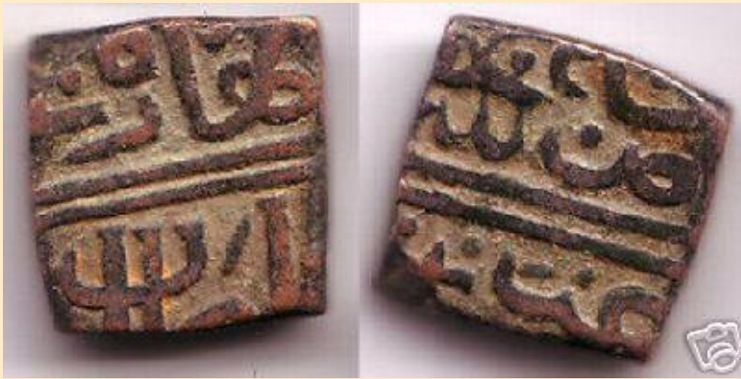
Bronze coin of Baz Bhadur

http://cgi.ebay.com/Scarce-bronze-falus-of-Baz-Bahadur-1555-1561-2-Malwa_W0QQitemZ8434406297QQcmdZViewItem#ebayphotohosting